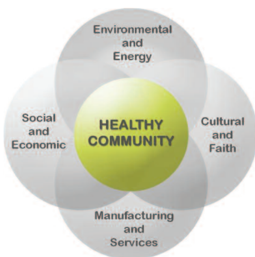
FIGURE 1: HEALTHY COMMUNITY'S IMPACT ON COMMUNITY-SUSTAINABILITY

utilizing the power of modern ICT solutions. The dramatic improvement that ICT solutions have made in other global industries, such as finance, marketing, manufacturing, services and entertainment, yields proven models that can be applied to the health industry worldwide. ICT has the power to drive innovation, collaboration, and transformation within the health industry. If deployed successfully, ICT also has the potential to foster incentives, creativity, and the tenacity needed to drive human capital to solve the tremendous disparities in healthcare delivery. Even in the most desperate communities in need, the