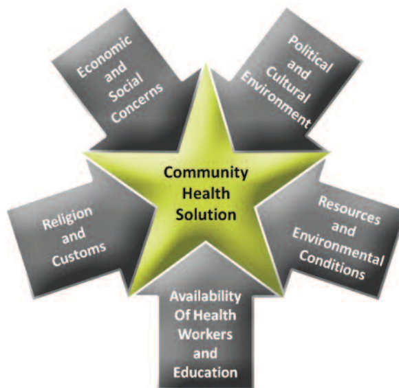
FIGURE 2: COMMUNITY HEALTH SOLUTION