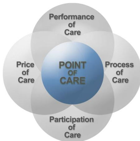
Figure 2: Impacting the Point of Care