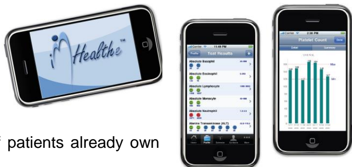
Figure 5: Personal Health Record Application - imHealthe™